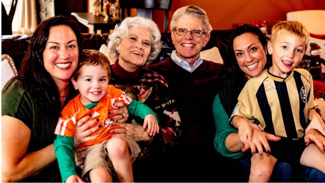
Findley family photo from Christmas 2019